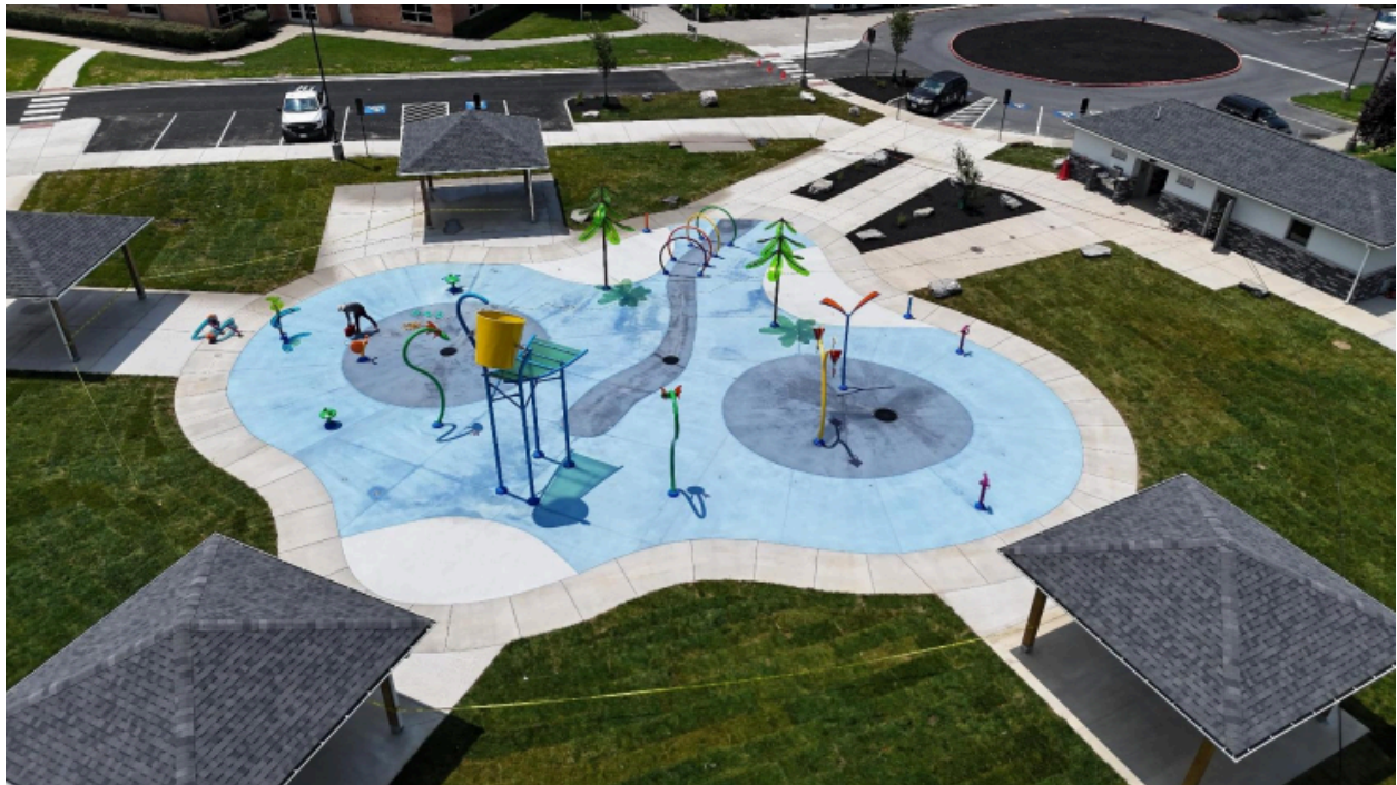
PHOTO OF SPRAYGROUNDS SITE